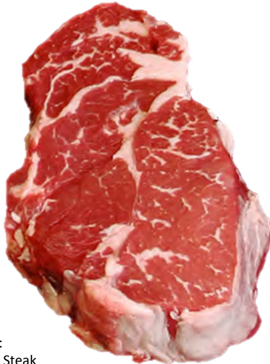
Beef Chuck Eye Steak

The Beef Chuck Eye Steak, Boneless B-C-45-D comes from a portion of the IMPS #116A Beef Chuck, Chuck Roll, which lies beneath the scapula or blade bone. The Beef Chuck Eye Steak is an extension of the blade or anterior end of a Beef Rib, Ribeye Roll, so it will have some of the same muscles. The largest muscle will be the Longissimus dorsi, which would be called the ribeye muscle in a rib steak. As the ribeye muscle progresses forward it gets smaller and stops at a point close to the 3 rd rib, so there are only 2-3 Chuck Eye Steaks on each side of the carcass.