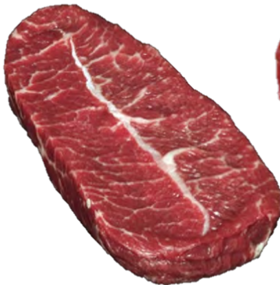
Beef Chuck Top Blade Steak

Either cut may be used for identification with the same code.