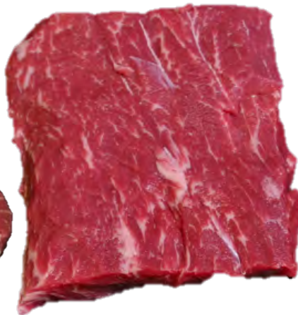
Beef Chuck Flat Iron Steaks