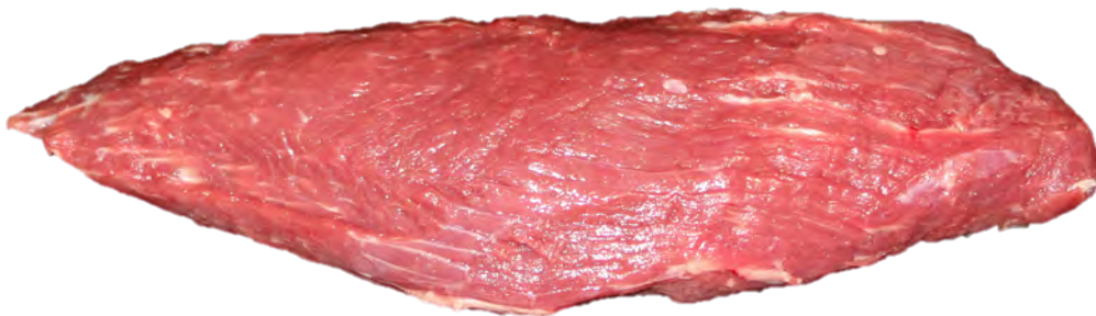
Beef Chuck Petite Tender (trimmed)

The Beef Chuck Petite Tender (B-C-21-D) is a small muscle located on the posterior edge of the scapula. It previously was a part of the IMPS #114 Beef Chuck Shoulder Clod, however, as popularity has increased, the majority of the Petite Tenders ( Teres Major muscle) are removed by packers and marketed independently.