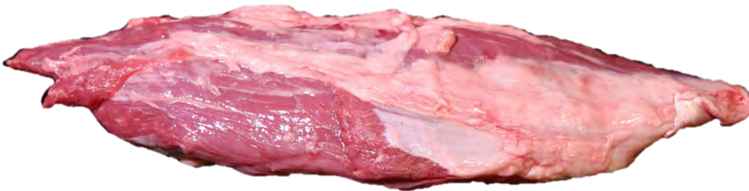
Beef Chuck Petite Tender (untrimmed)